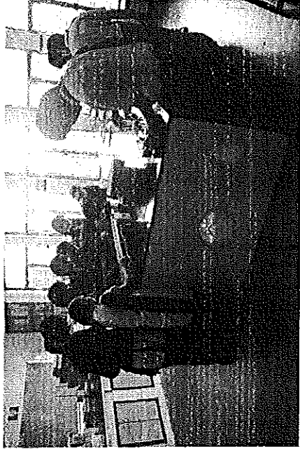
CHEMISTRY LAB PHOTO