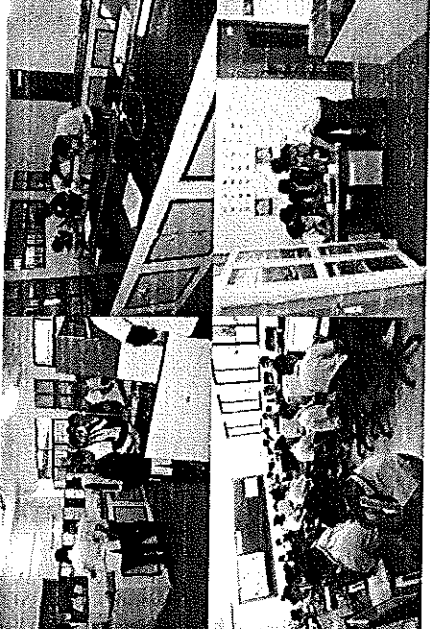
PHYSICS LAB PHOTO